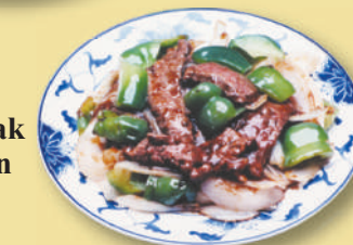
#73 Pepper Steak with Onion