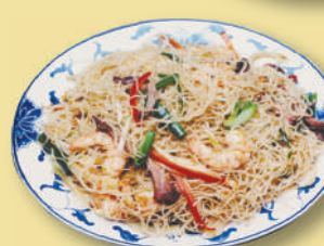
#49 Singapore Special Mein Feng