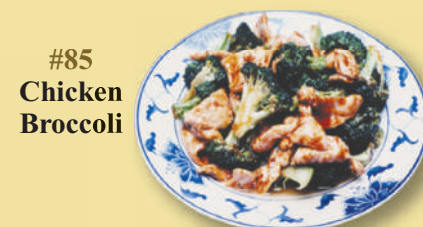
#85 Chicken Broccoli