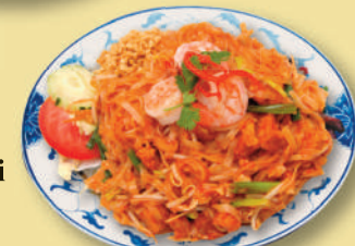
#62 Shrimp Pad Thai