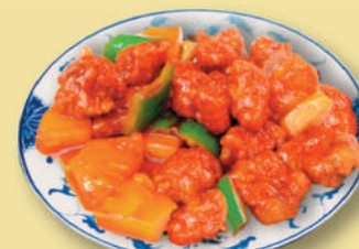
#26 Sweet & Sour Pork with Pineapple