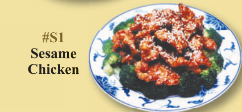
#S1 Sesame Chicken