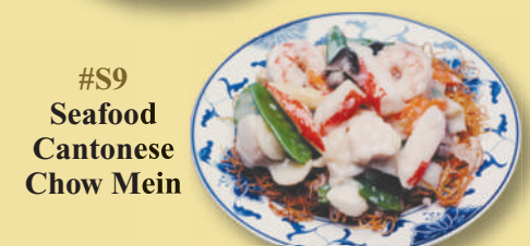
#S9 Seafood Cantonese Chow Mein