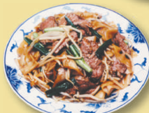
#47 Beef Ho Feng