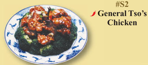
#S2 General Tso's Chicken