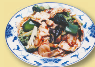
#S7 Tai Dop Voy