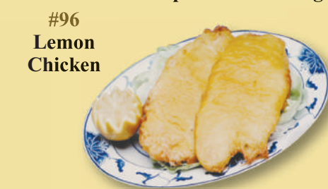
#96 Lemon Chicken