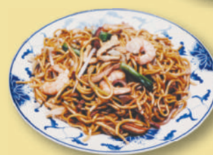
#53 House Special Lo Mein