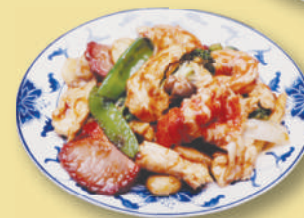
#S11 Happy Family