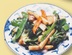
#109 House Special Mixed Vegetable